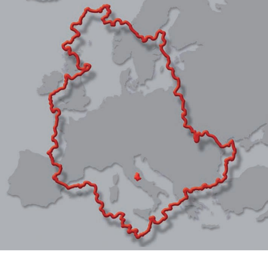
Produced using contributions from the European Union